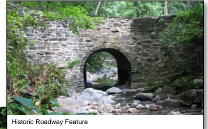
Historic Roadway Feature